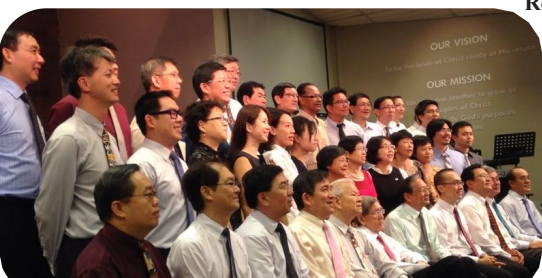
Our Elders, Deacons & Staff looking ahead to another year of God's faithfulness.

Praise God for a God-honouring and people-edifying AGM service. A record 439 members and other regulars with their children and youth gave thanks for God's faithfulness to our church family. You can watch Chairman's exhortation and announcement about