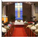
Photo Opportunity with Pews...

Like to have a keepsake picture with the pews? We hope to compile a montage of as many of such pictures of Frankelites (alone, with families or cells) for our new church magazine. Our volunteer photographers will snap these on 3 & 10 Nov. Time: 1.30pm to 2.30pm.