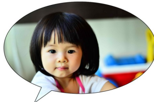
Somebody once said, "The meaning of life... is love."